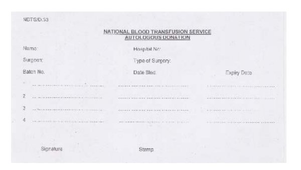
Figure 1 Autologous blood collection form

The remaining 635 patients comprised 89 males and 546 females. They were aged between 14-74 years, mean of 41.7 years, with a male: female ratio of 1:6.1. The age distribution is depicted in Figure 2.